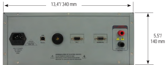
The STS 1657 Rear Panel provides connections for AC Input, USB interface, PLC I/O and RS232 interface option.