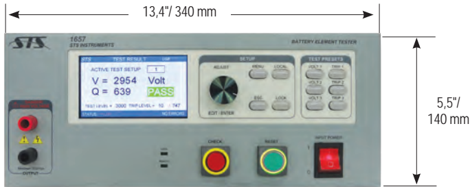
The STS 1657 is designed for bench top use.