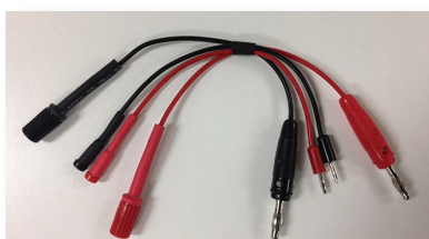
Adapter Cable Kit

Note 1: QCT Power Connector must be ordered with 44M0x Mainframe or retrofitted by customer service.