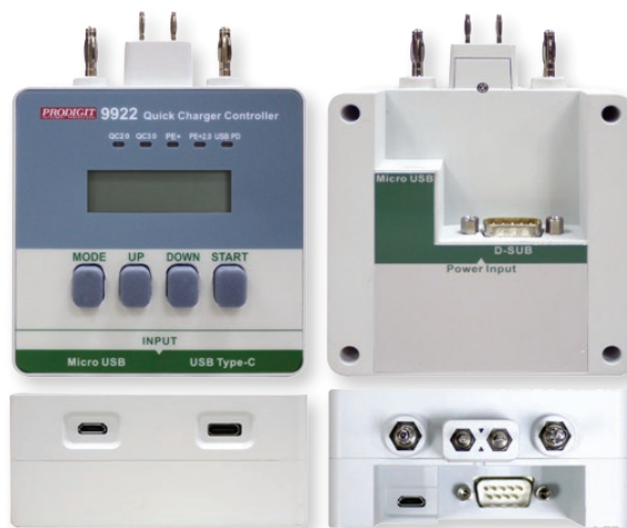
QCT Option - Front, Back, Top, Bottom Views