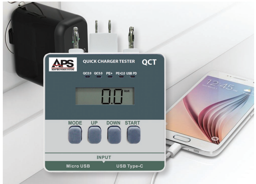
Option QCT - Quick Charger Tester